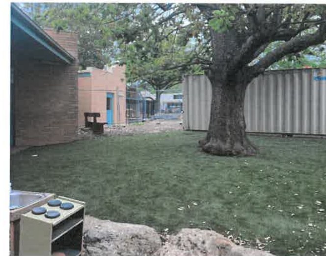
Passive play/ outdoor board games