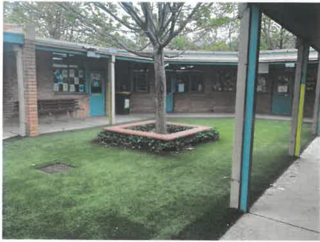
Passive play area/ outdoor board games