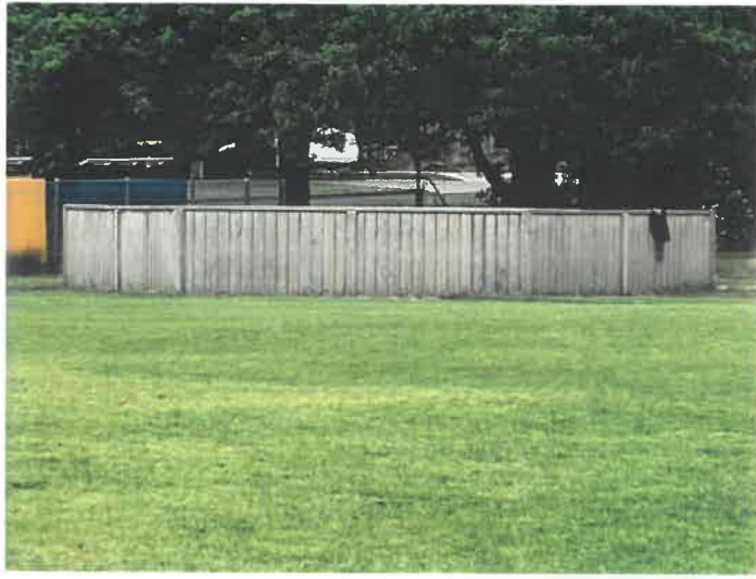
Senior Gaga Pit