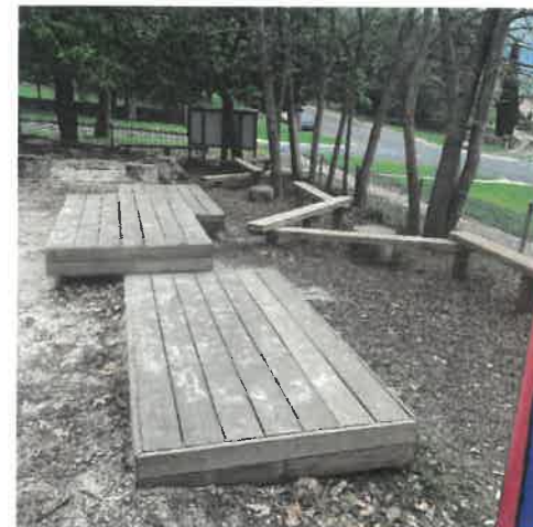
Seats, walking beams