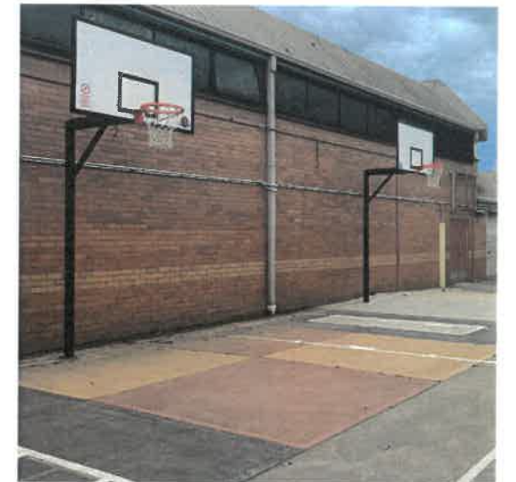
2 Basketball shooting circles