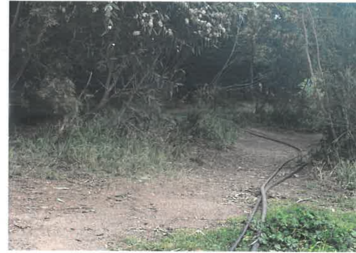
Retaining wall pathways