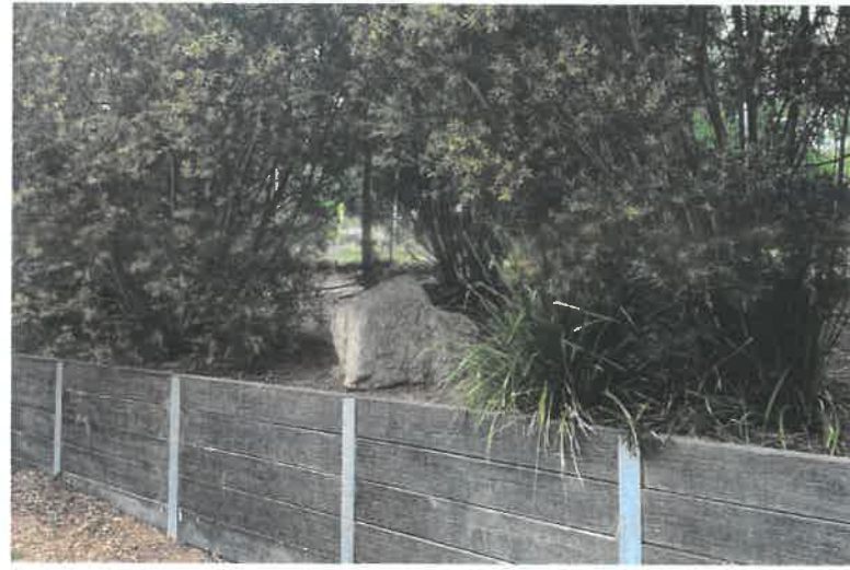
Retaining wall pathways