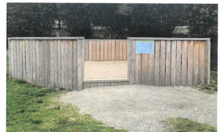
Junior Gaga Pit